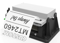
917EF051800000 PRINTING MECHANISM MT2460 CUT+VERT SUPP