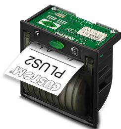
915CW100300022 PRINTING MECHANISM PLUS2