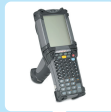
Data terminals & PDA