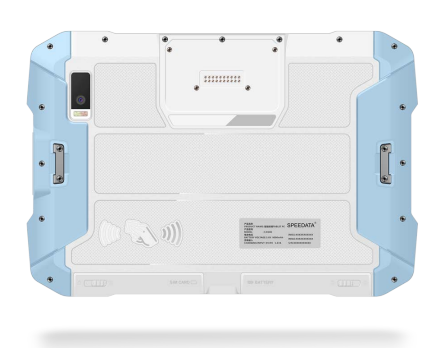
backside of the SD100 Orion Plus