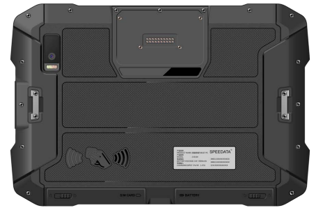
backside of the SD100 Orion Plus